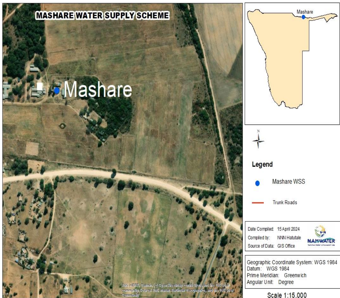
Figure 1: Mashare Location Map

The EMP is for an existing water supply scheme and it is therefore only for the operation and maintenance of the scheme.