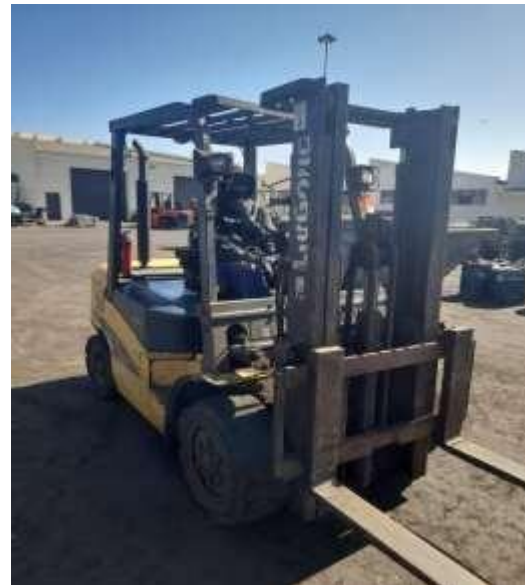
Photo 7. The loading of scrap metal in containers for export. Photo 8. Forklift and operator