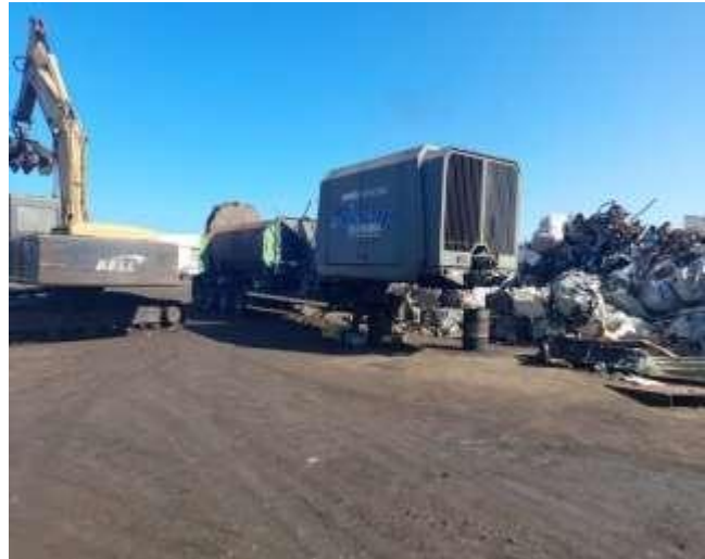
Photo 3. The baling machine used to cut scrap metal. Photo 4. The baling machine for compacting and shredding