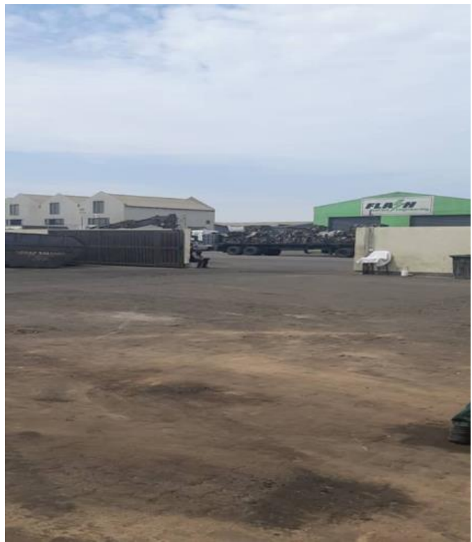
Photo 1. The weighing scale of scrap materials upon arrival. Photo 2. The entrance for loading and unloading of trucks.