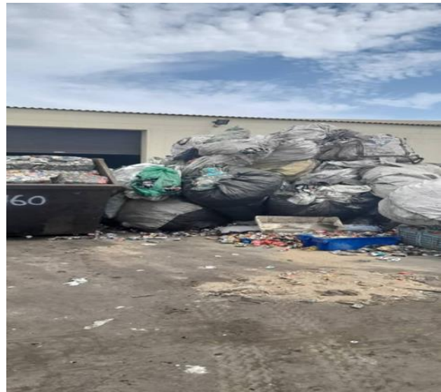
Photo 3 & 4. The separating and sorting of waste materials