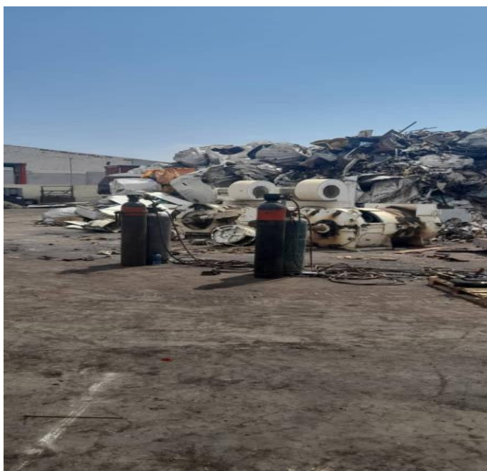
Photo 5. Workers cutting scrap metal using grinder. Photo 6. Gas bottles in use