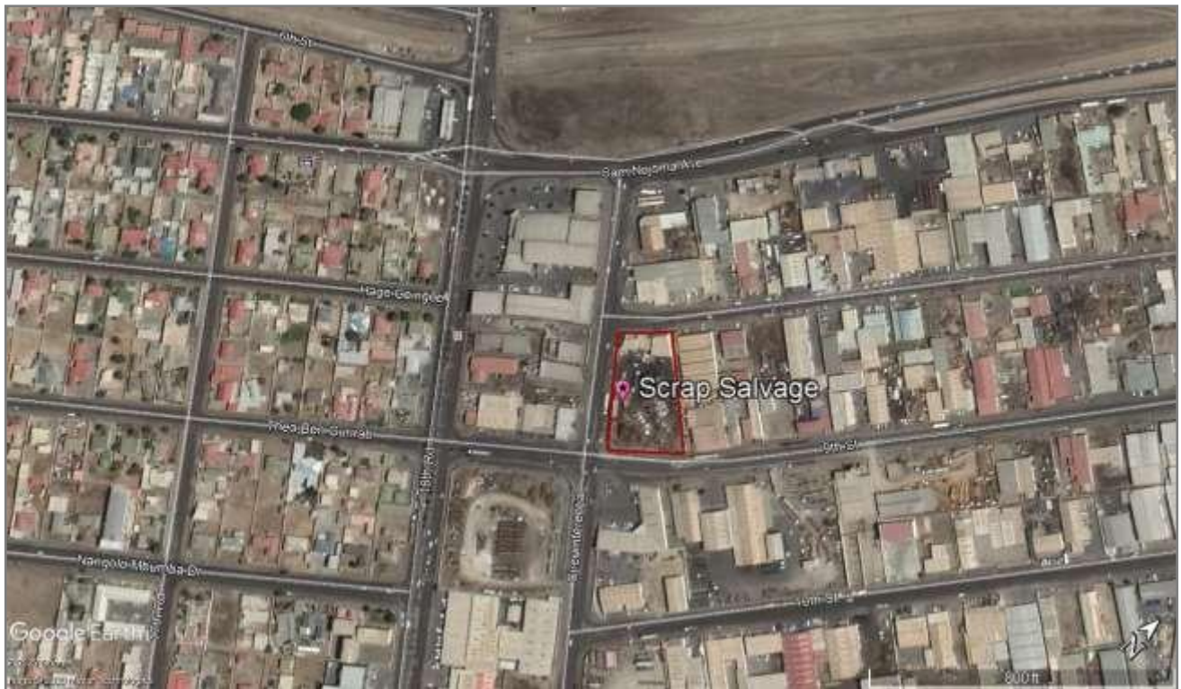
Figure 2. Existing Site Layout