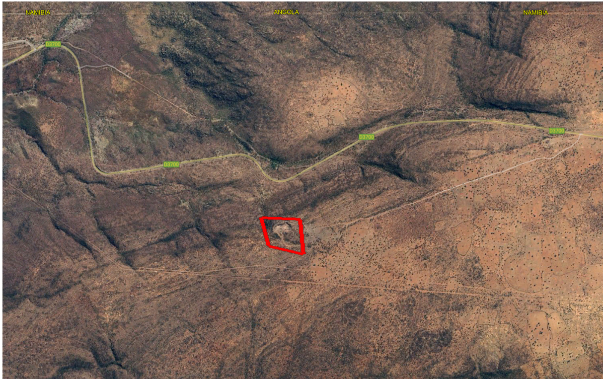
Figure 1: Location of Mavinga Stone Quarry and Crusher

The aim of an operational EMP is to ensure that the existing stone quarry and crusher project is conducted in an environmentally acceptable and safe manner. This Environmental Management Plan (EMP) will serve as a managing tool for the operational activities during the operational phase of the Mavinga Quarry and Stone Crusher project, in Omatemba, Ruacana. (See figure 1. below).