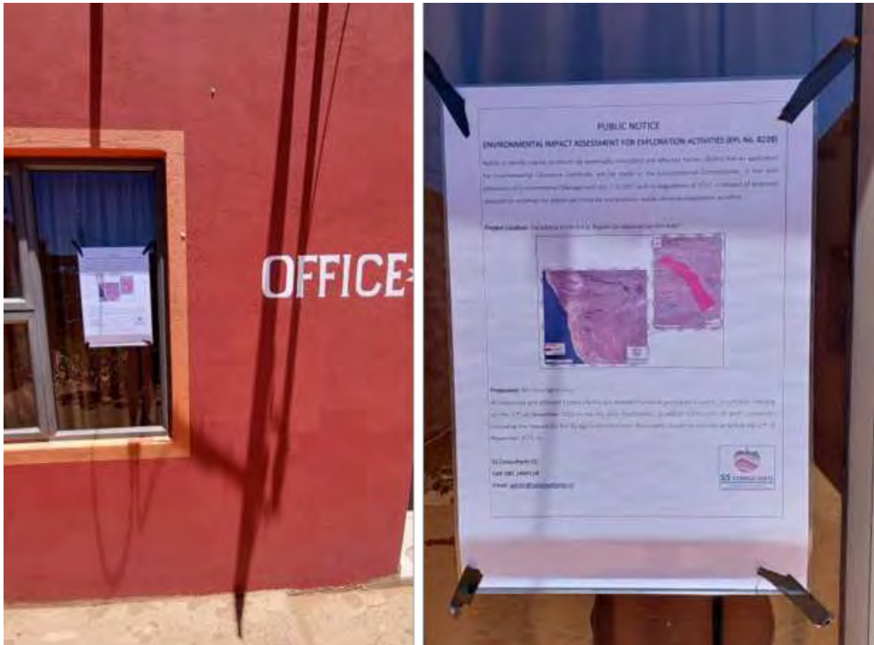
Site notices at the home affairs office in Karasburg